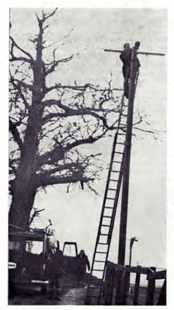
MANWEB linesmen at work on the spur line through Delamere Forest after trees crashed down on the conductors.

THE SAVAGE storm which lashed most of Britain during the night of Friday, 2nd January, caused the most widespread damage ever experienced to the overhead distribution networks of many Area Electricity Boards—including MANWEB.