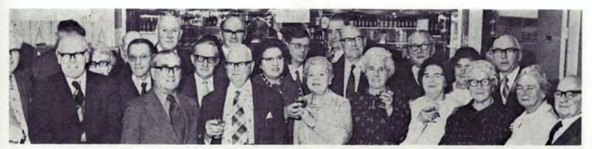
A toast to one and all from members of the Liverpool Retired Employees' Group, joined here with some of their invited guests to the annual Christmas Dinner.