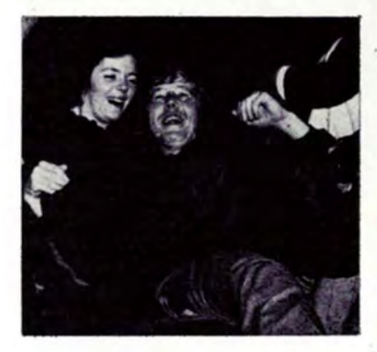
FUN AND GAMES AT HEAD OFFICE STAFF PARTY