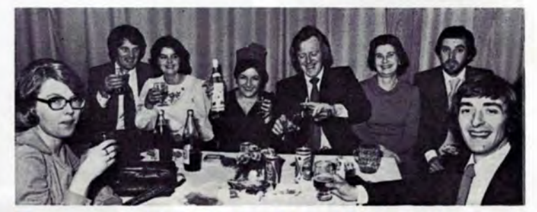
Some members of the Clwyd District S & S Club Committee enjoy a festive drink

Retired members await their Christmas fare