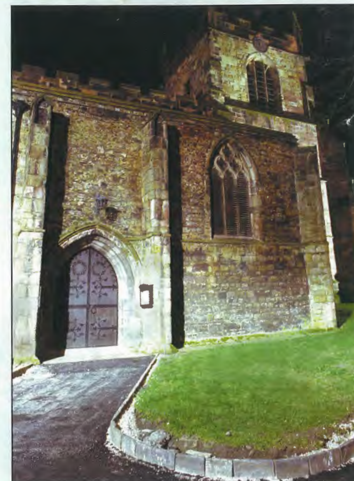
The floodlit Cathedral showing one of the main entrances.

enabled Phase 1 of the lighting project. Additional lighting will be added to the structure of the Cathedral itself, while the Dean and Chapter has also received £175,000 from the WDA to widen the project with the