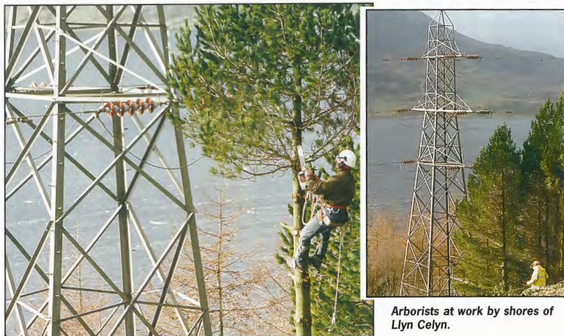
Arborists at work by shores of Llyn Celyn.

MANWEB'S Rural Care scheme entered Snowdonia for the first time with a tree clearance mission around the scenic shores of Llyn Celyn.